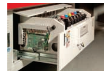
Ink control tray