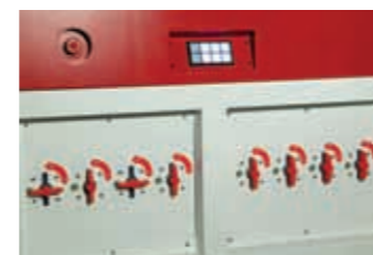
Switches to activate either of the 8 vacuum compartments