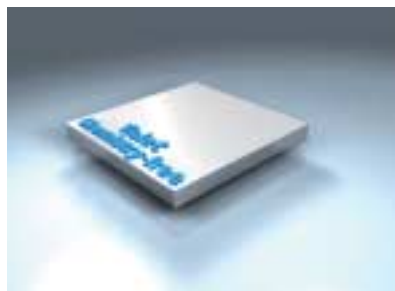
Plate Specifications :N92-VCF